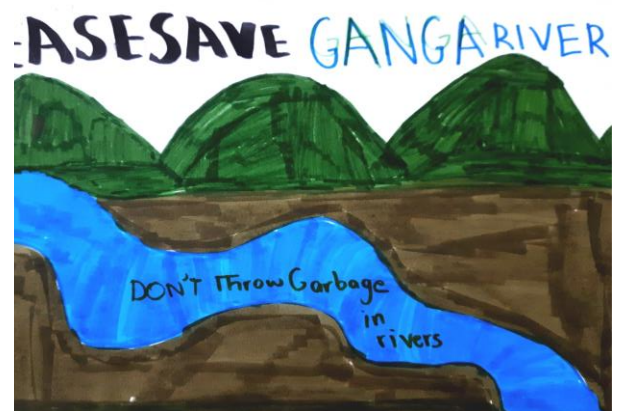
ARLEEN KAUR VI-D