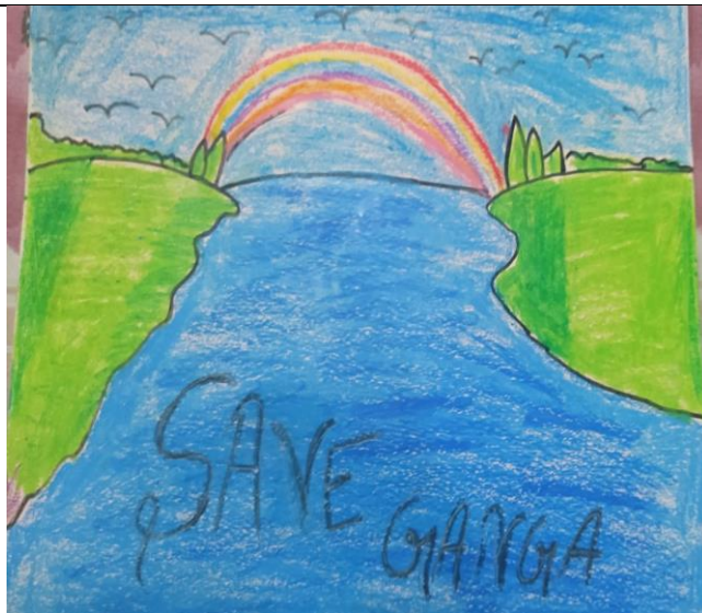
LUVYA GARG VI-A