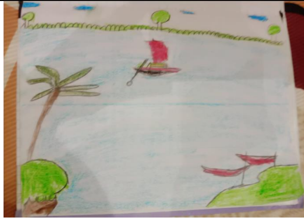
TANISH PAL VI-E