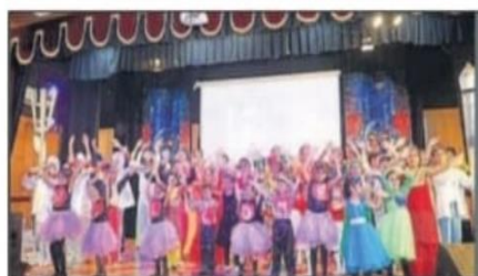
The event showed the kaleidoscopic presentation of a journey into the AI world